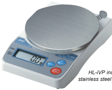
HL-iVP includes stainless steel pan cover