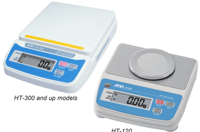
HT-300 and up models