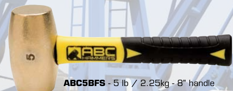
ABC5BFS - 5 lb / 2.25kg - 8" handle