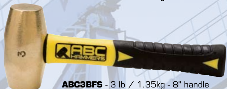
ABC3BFS - 3 lb / 1.35kg - 8" handle