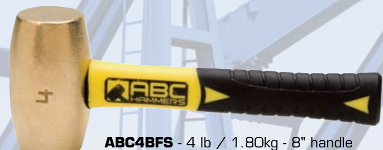
ABC4BFS - 4 lb / 1.80kg - 8" handle