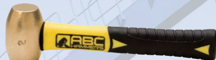
ABC2BFS - 2 lb / 0.90kg - 8" handle

Our Brass Hammers are the most durable hammers we offer and should always be used in place of steel hammers in any metal working application. Our non-marring soft brass head helps absorb impact and helps reduce or eliminates work damage. They are non-sparking for safe use near combustible materials.