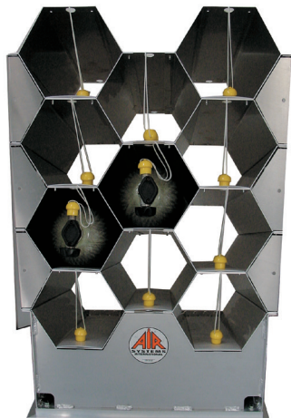
AIR-KADDY™ With Thread Savers® AK24-11TS

AIR-KADDY's™ unique modular design allows for expansion as needed to accommodate your SCBA storage requirements - today and in the future! Available in free standing, Series 40, and vehicle style, Series 24, narrow profile. All racks are lined with nylon pads to prevent cylinder scratches. Custom sizes available.