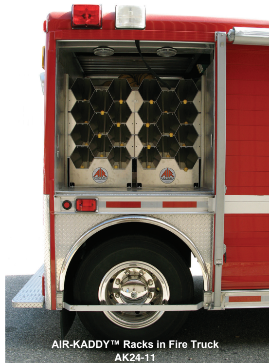
AIR-KADDY™ Racks in Fire Truck AK24-11

AIR-KADDY™ 8, 11, and 15 cylinder storage racks can be cart mounted.