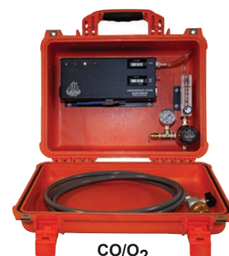
CO/O 2 Cylinder Test Kit AQTCOO2KIT