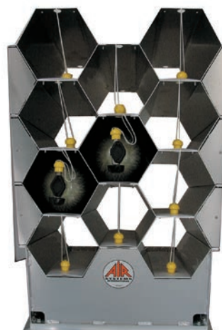
AIR-KADDY™ with Thread Savers® AK24-11TS