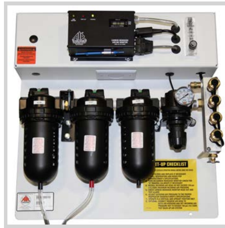
BB100-COPM 100 cfm Steel Panel 123 cfm flow capacity 4 couplings