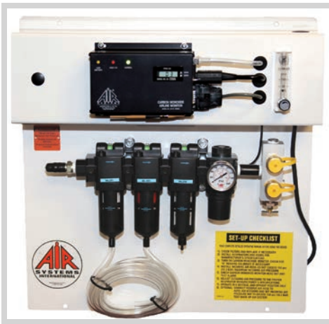
BB30-COPM 30 cfm Steel Panel 48 cfm flow capacity 2 couplings