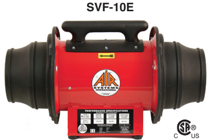
10" to 8" Duct Adapters Supplied for Intake and Exhaust