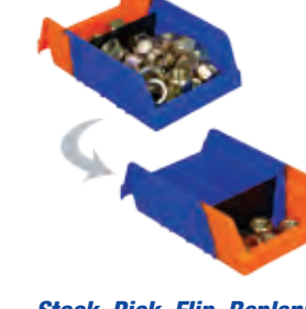
Stock Pick Flip Replenish

• VALUE - Low-cost alternative to high-end inventory control systems