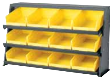
Bench Pick Rack Holds up to 24 bins on 3 shelves