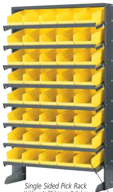
Single Sided Pick Rack Holds up to 96 bins on 8 shelves Maximum 400 lb. weight capacity

Angled shelves increase picking efficiency