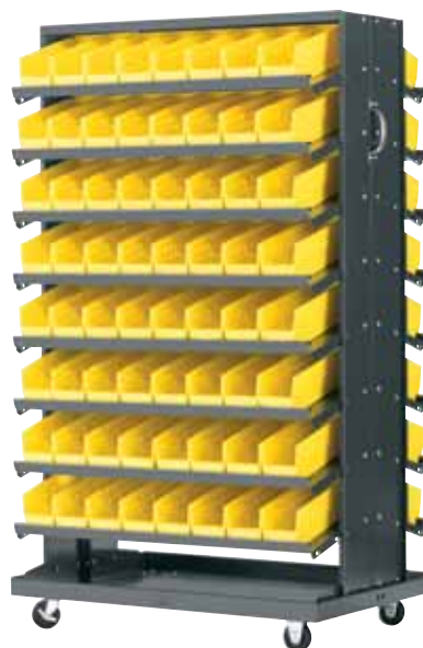
Double Sided Pick Rack & Mobile Kit Creates a mobile double sided pick rack Maximum 500 lb. weight capacity