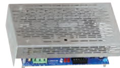
PSC1 mounted above AL600ULXB