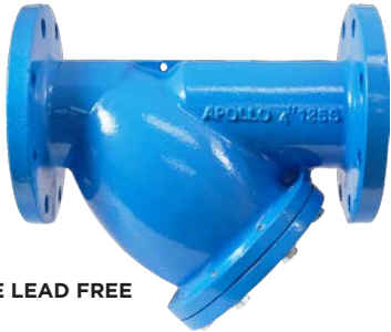
YCF-E LEAD FREE