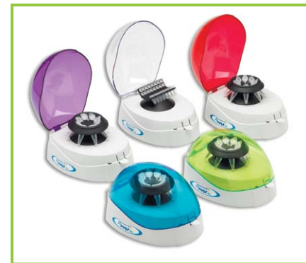
Available in 5 colors

The myFuge™ Mini Microcentrifuge is a personal centrifuge that virtually fits in the palm of your hand. Ideal for quick spin downs of microtubes and PCR tubes, the myFuge is extremely easy to use. Simply close the lid and the rotor instantly reaches 6,000 rpm. Open the lid, and the improved braking system quickly and smoothly decelerates the rotor to a complete stop in just one second.