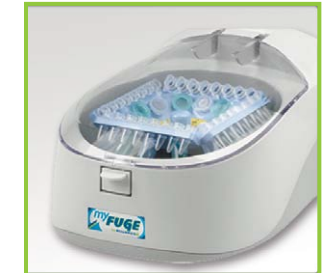
Compact, low profile design

Unlike traditional mini centrifuges, the new myFuge™ 12 eliminates the need to change rotors when switching between microtubes and PCR strips. The included, unique COMBI-Rotor™ is all that is required for running 12 microtubes and/or 4 (eight position) PCR strips.