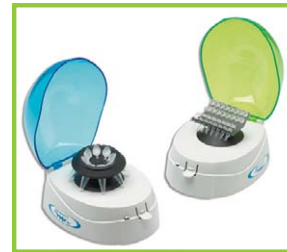
Includes both rotors