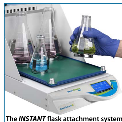
The INSTANT flask attachment system

The convenient MAGic Clamp™ platform is also available for use with Erlenmeyer flasks and test tube racks. This unique, magnetic attachment method is the easiest way to instantly change between flask clamps of different sizes.