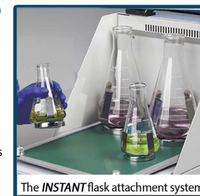
The INSTANT flask attachment system

Incu-Shaker™ 10L is a heavy-duty performer, designed for high capacity loads and continuous use. Its outstanding temperature accuracy and uniformity are supported by proprietary heat distribution technology that ensures precisely maintained temperatures throughout the chamber. Inconsistencies due to stratification are reduced to negligible levels and the selected temperature is precisely maintained within 0.25%, even in the corners. In the Incu-Shaker 10LR model, a powerful compressor provides cooling as low as 15 degrees below ambient.