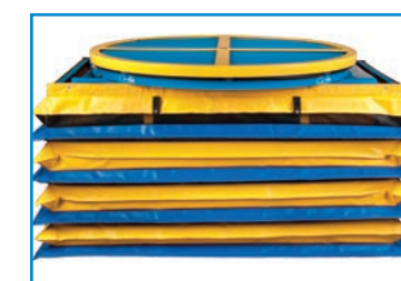
Accordion bellows skirting