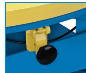
Brake prevents rotator ring from turning