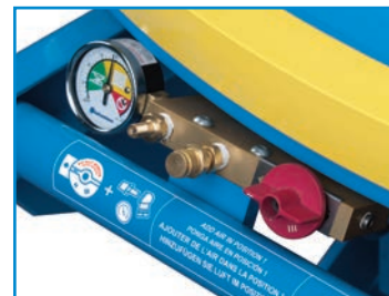
EZ-Adjust Knob Provides Up To 1200 lbs Of Capacity Adjustment With the Turn of a Knob