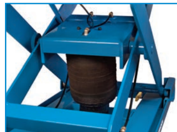
Unique Patent-Pending, Self-Contained Pneumatic System Offers Unsurpassed Performance