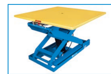
Oversize rotating platform