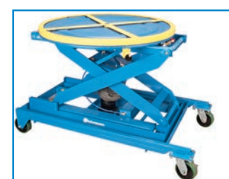
Cart portability with 2 swivel and 2 fixed caster wheels