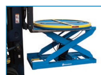
Easily moved with a fork truck