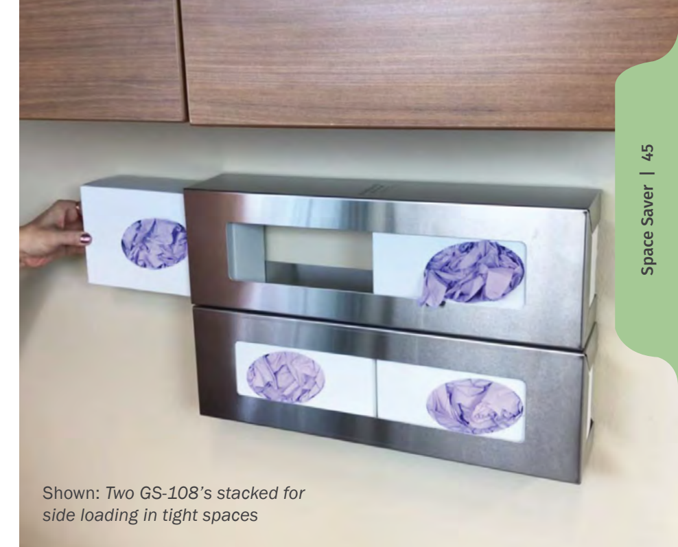
Shown: Two GS-108's stacked for side loading in tight spaces