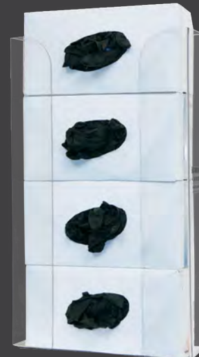
GP-340 (PET) Quad - Top Load