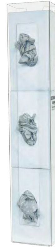
GP-107 (PET) Triple - Space Saver Also available: Double - GP-106