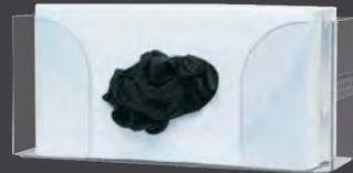
GP-310 (PET) Single - Top Load