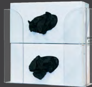
GP-320 (PET) Double - Top Load