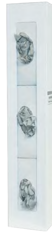
GB-068 (CRS) Triple - Space Saver Also available: Double - GB-067