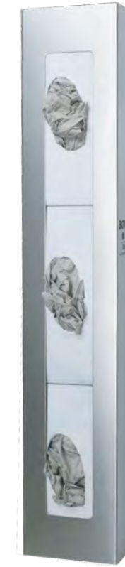
GS-109 (STS) Triple - Space Saver Also available: Double - GS-108