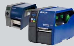
NEW BradyPrinter i7100 and legacy PR PLUS printer