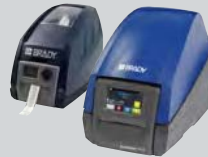
NEW BradyPrinter i5100 and legacy IP™ Printer

The following pages contain 3" core label rolls that are designed for use in these printers unless otherwise noted.