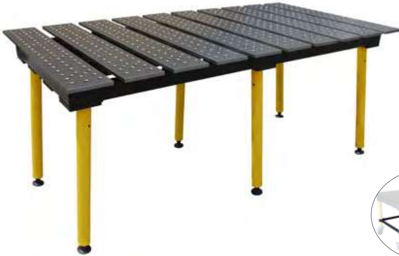
TABLE SURFACE DIMENSION: 78" X 38" (ACTUAL)