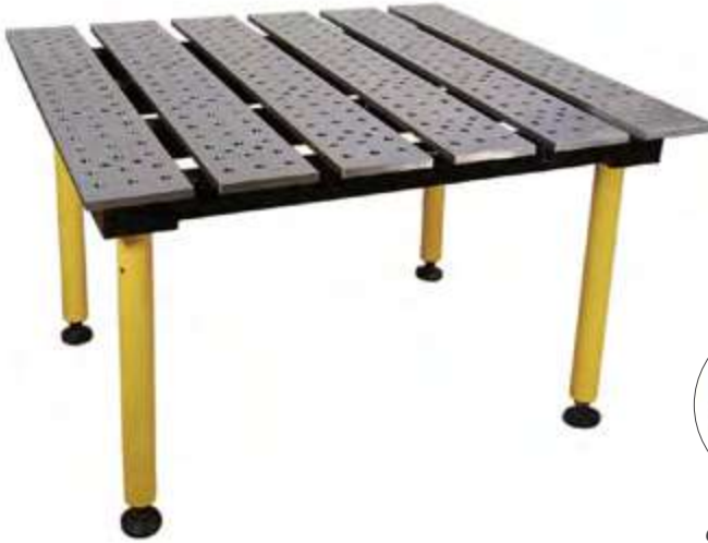
TABLE SURFACE DIMENSION: 47" X 38" (ACTUAL)