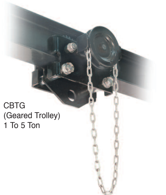
CBTG (Geared Trolley) 1 To 5 Ton