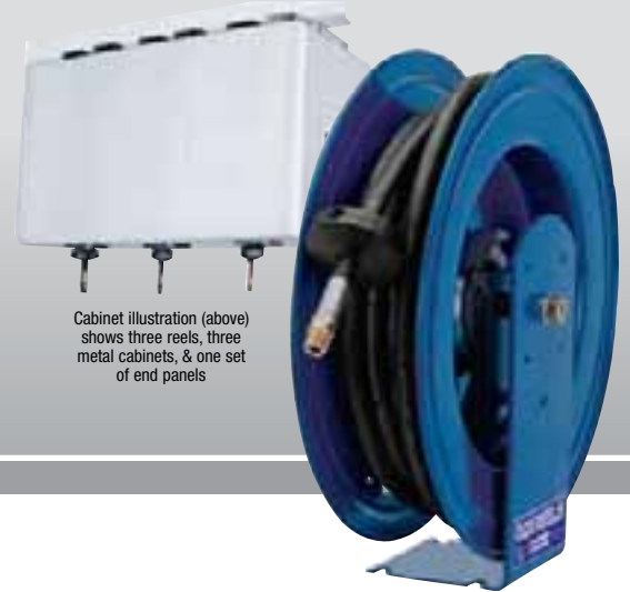
Cabinet illustration (above) shows three reels, three metal cabinets, & one set of end panels

END PANELS: #1798-1 Includes a set of two, all steel construction. Finished & caps the ends of each bank. Weight: 8 lbs.