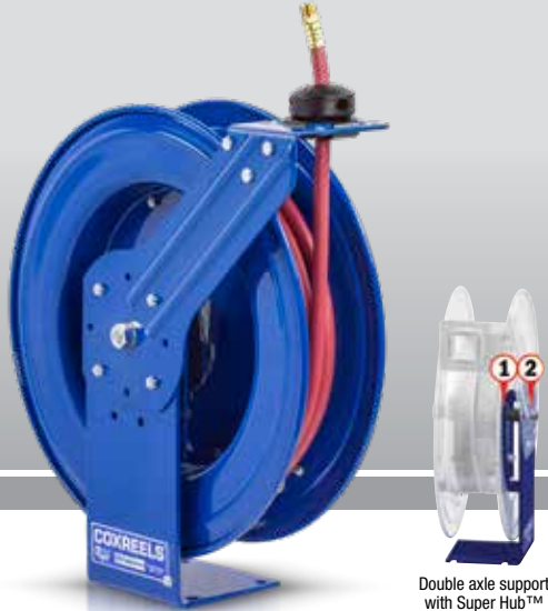
Double axle support with Super Hub™

COXREELS® SH Series “Super Hub™” spring driven hose reels, like the P Series, have a long history of dependable performance. The larger chassis and frame accommodate longer lengths and larger diameters of hose. Coxreels’ original Super Hub™ dual axle support system increases the stability during operation, reduces vibration and strengthens the structural integrity of the reel.