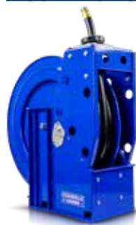
FLOOR OR CEILING MOUNT