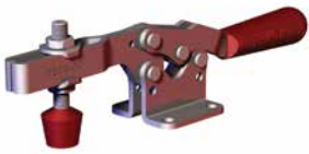
235-U Flanged Base U-Bar