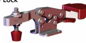
235-UR Flanged Base, U-Bar with DESTACO® Toggle Lock Plus