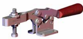
235-USS Flanged Base, U-Bar, Stainless Steel