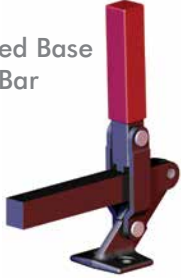
528 Flanged Base Solid Bar