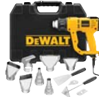
Heat Gun Kit with LCD Display