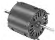
FIG. J D364