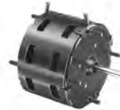
FIG. D D1119