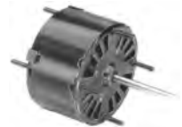
FIG. E D120, D121, D609, D603, D126, D127, D190, D532, D181