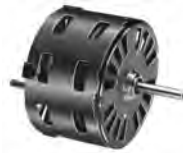
FIG. G D106, D105