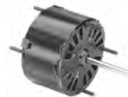
FIG. N D132, D133, D188