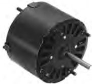
FIG. F D1134