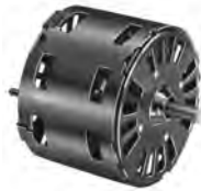
FIG. B D107