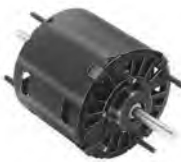
FIG. K D365