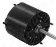
FIG. H D514, D515