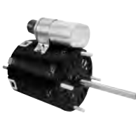
FIG. A D1127

NOTES: 75: Shell Turbo 68, low temp. oil (-40°F) 76: Impedance Protected 77: Has hubs for end rings 78: Closed construction 85: Air Over