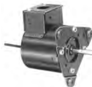
FIG. L D184