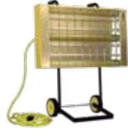
Portable Cart Unit CH 6424-1C with FHK-1 Cart

MODEL CH 2212-1C has two 1000 Watt elements that can be switched on / off by toggle switches to produce 1000 Watts or 2000 Watts of heat. - 15' cord and NEMA 5-20 molded plug.