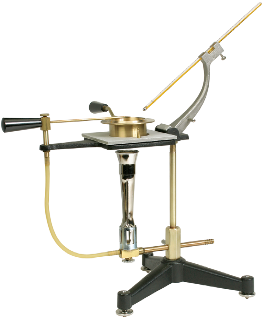
Cleveland Flash & Fire Point Tester