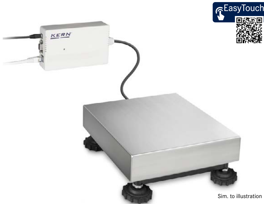
Sim. to illustration

Industrial platform scale with digital weighing transmitter KERN KGP