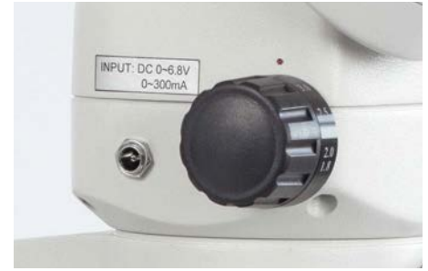
Plug in for power supply