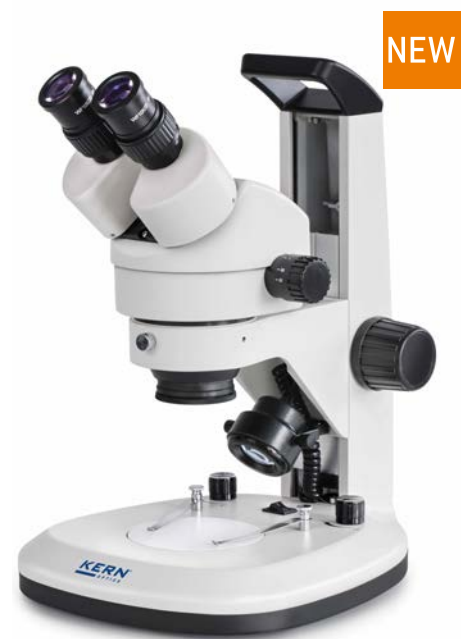
OZL 467 With handle