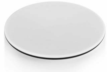
Stage plate white