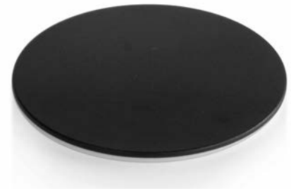
Stage plate black