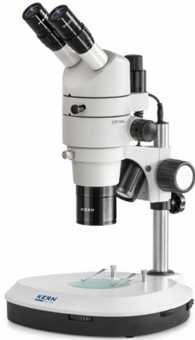
OZR 564 With illumination