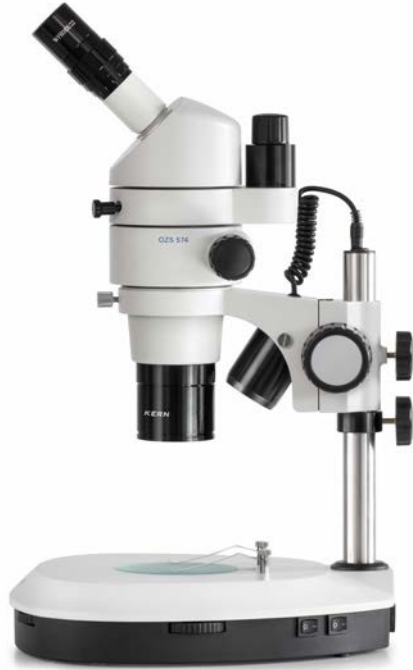
OZS 574 With illumination