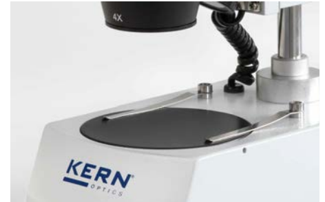
With black stage plate