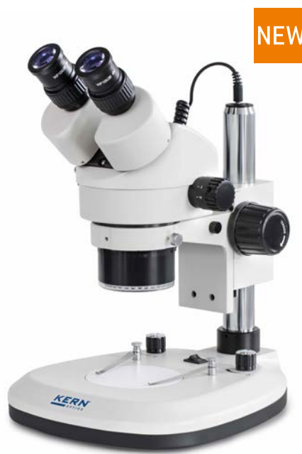
OZL 465 With ring illumination