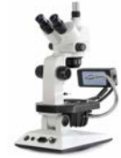
Backside of OZG 497