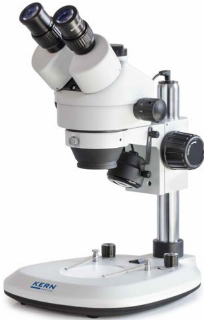
OZL 464 With standard stand