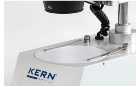
With white stage plate