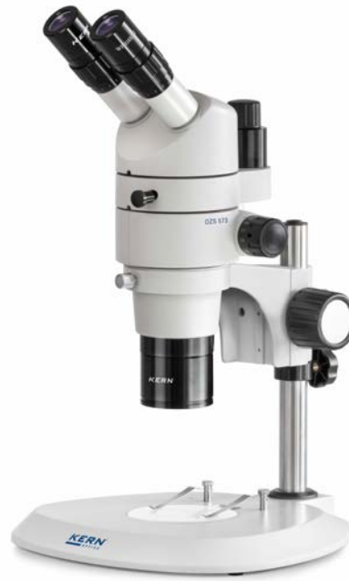
OZS 573 Without illumination