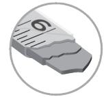
Multi-layer steel blade