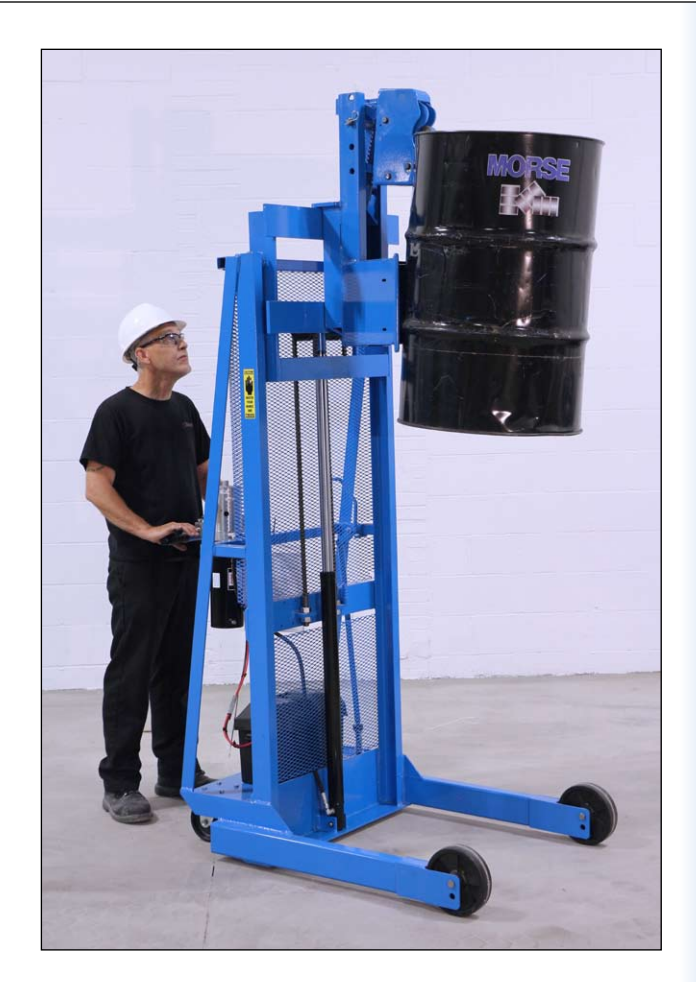
Model # 512-125 with battery power drum lift. Battery and charger are included.