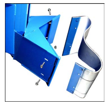
Belt Kit Option # 2523-P puts a shock absorbent surface in front of the steel backrest of the MORSPEED<sup>TM</sup> to protect the finish on your drum. It is easy to install using 4 bolts provided.