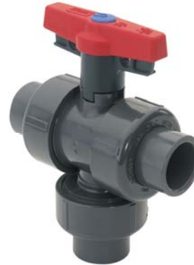
Vertical 3-Way Valve