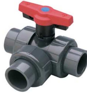
Horizontal Diverter Valve