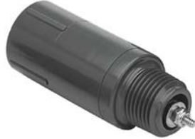
Mipt x Fipt