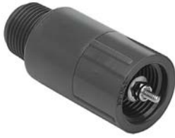
Fipt x Mipt