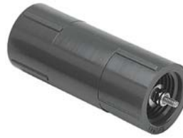
Fipt x Fipt