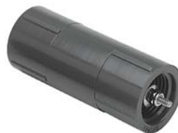
Fipt x Fipt