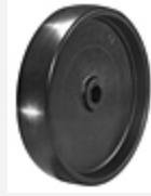
BT-W Solid Polyolefin Wheel