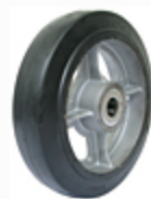
BT Cast Iron Center Moldon Rubber Wheel